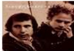
The Boys by Lin